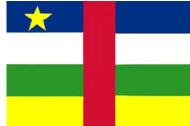
Central African Republic